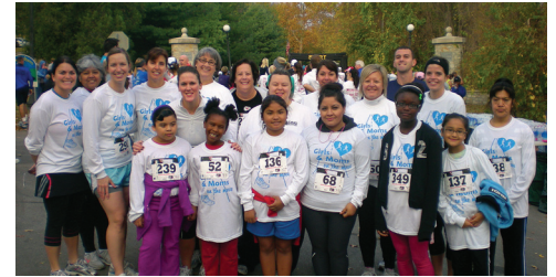
Kansas City “Girls & Moms on the Move” participants