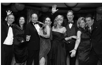
Spirit of the Heart Gala guests

Visit our website at mplsheart.org/gala for updates as we plan our 30th anniversary celebration in 2012!