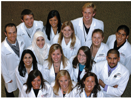
2011 MHIF research interns

The MHIF Summer Internship Program in Cardiovascular Clinical Research provides undergraduates interested in health care a unique opportunity to experience cardiovascular